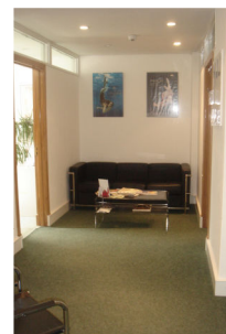
Ground floor waiting area